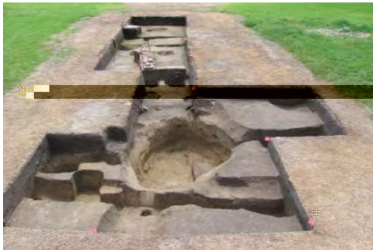
Excavated Feature 105 at La Pointe Krebs, another LDP, in planview (Gums and Waselkov 2015).