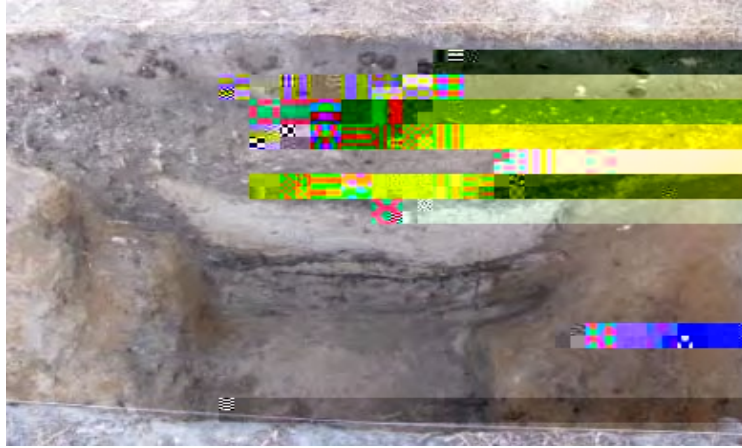
In progress bisection of Feature 163 from the La Pointe Krebs excavations (Gums and Waselkov 2015). Barrel staves and hoops found below this elevation.